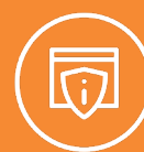
IT and technology