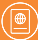
residence and citizenship