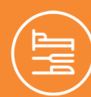
hospitality and tourism