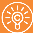
patents and IP